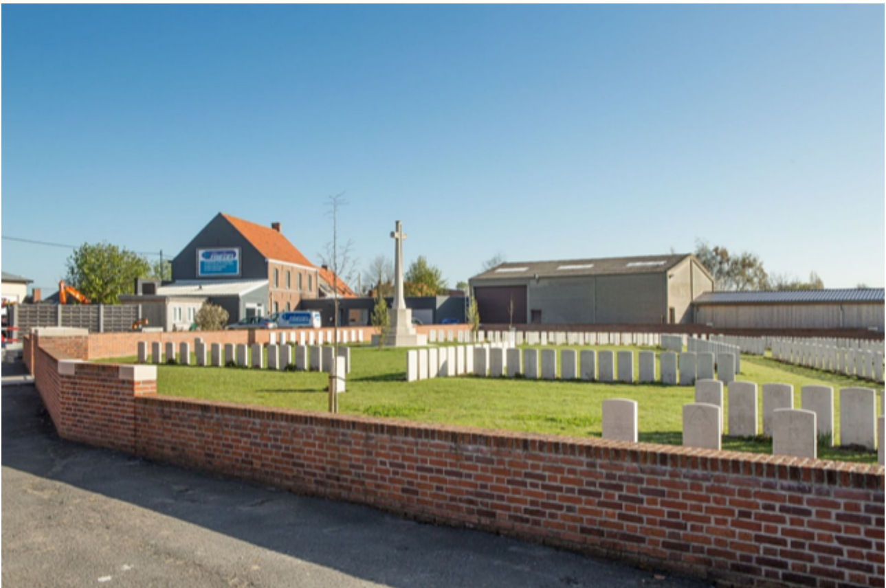
St Julien Dressing Station Cemetery

Worcestershire Regiment. 17th Btn. Serjeant. 64417. Died 04/12/1918. Dungannon. St Andre Communal Cemetery, Nord, France