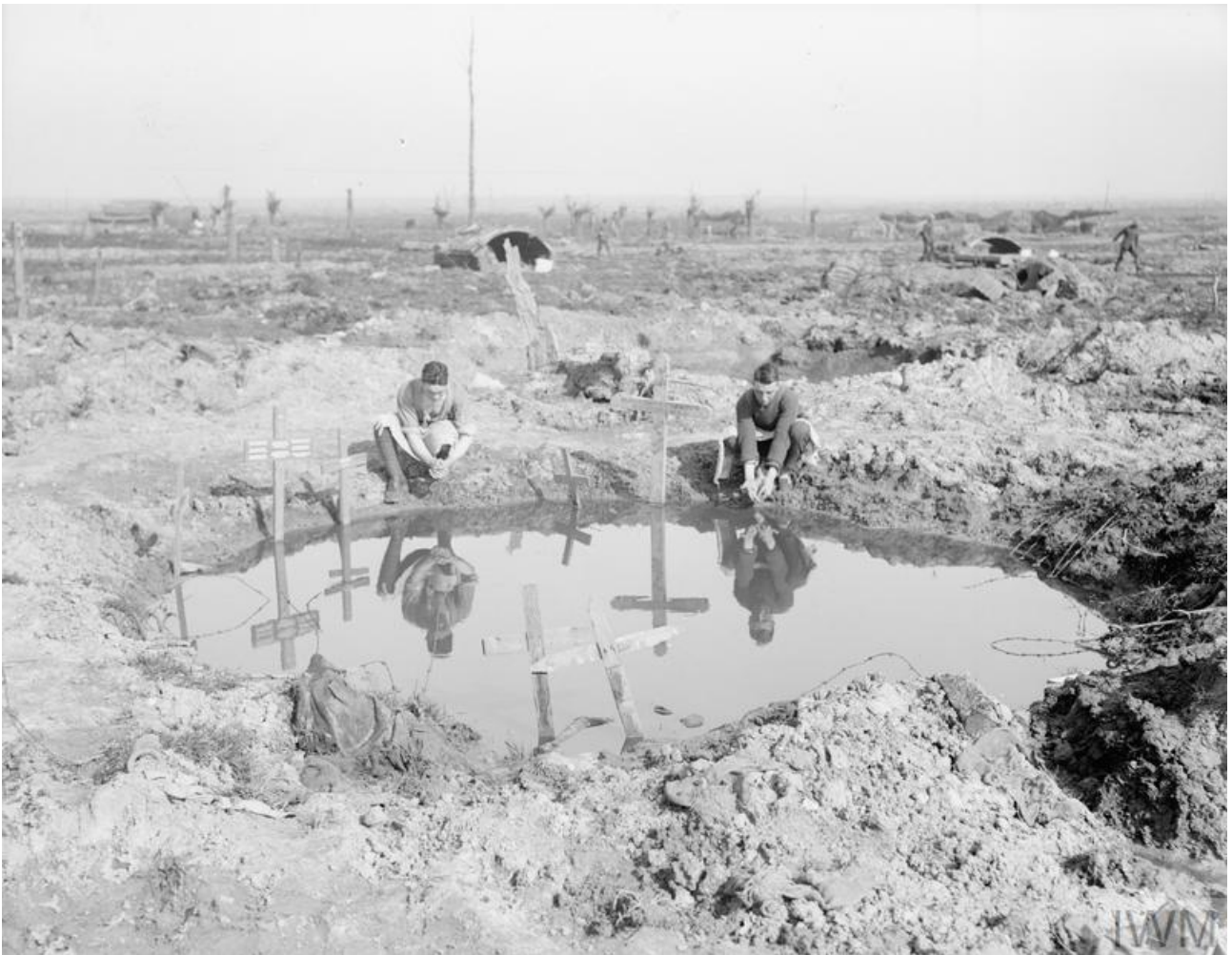
Soldiers washing themselves on the edge of a water-filled shell crater at St. Julien (29th Division Sector).