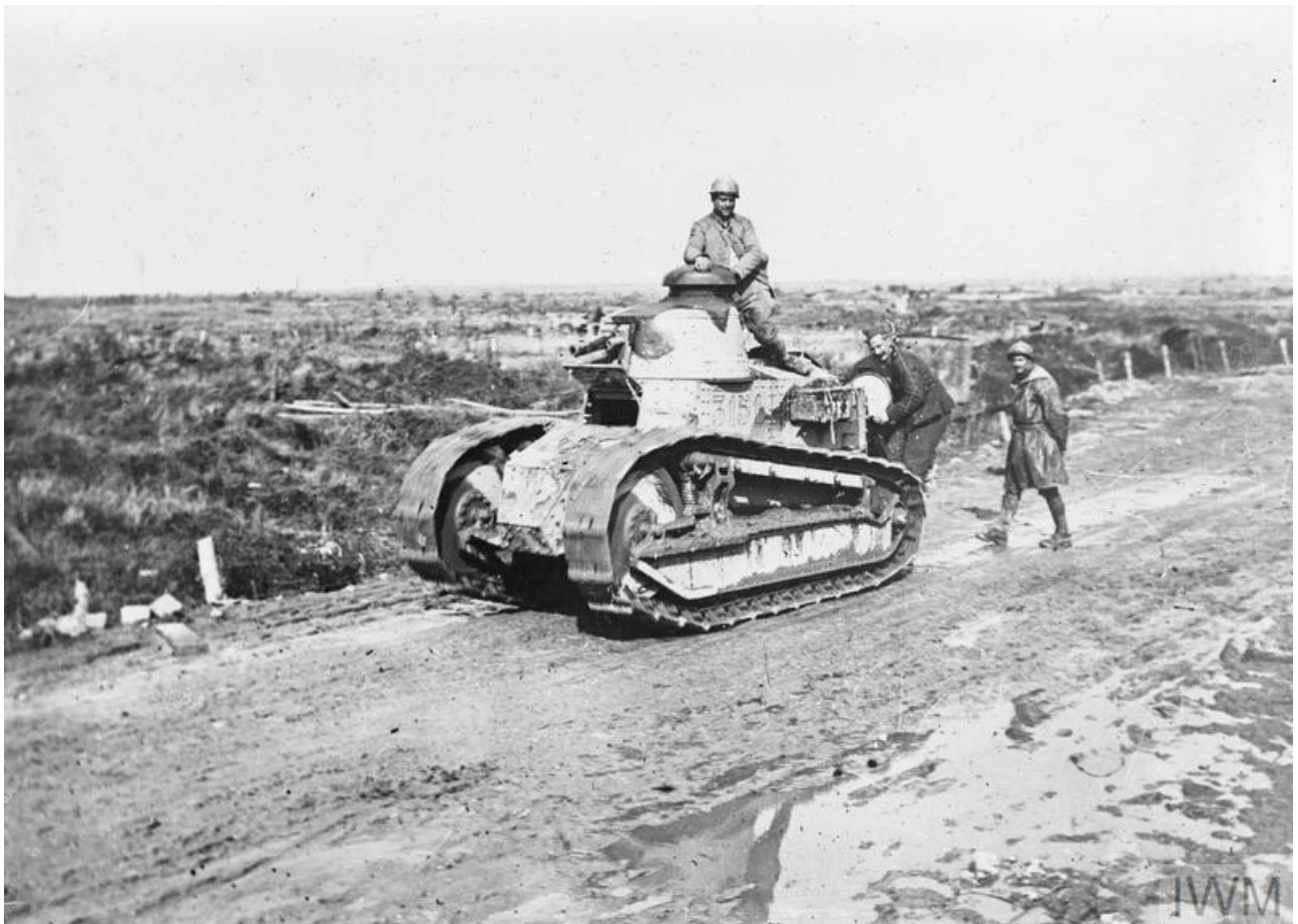
A French Renault FT-17 tank, serial number 3151, on the road near St. Julien, 2 October 1918.