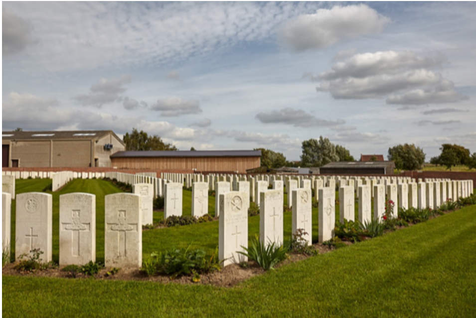
St Julien Dressing Station Cemetery