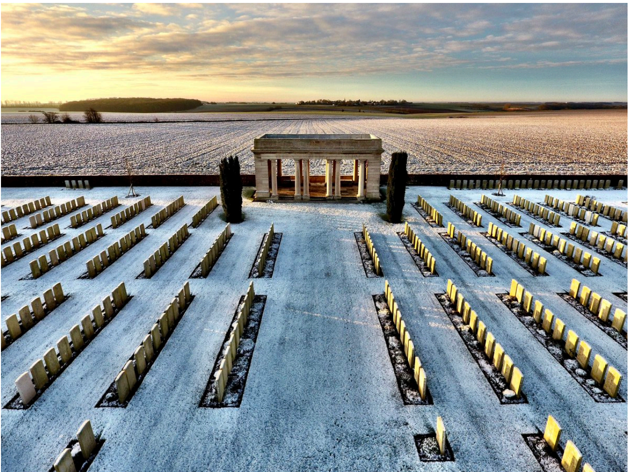
A frosty morning again on the Somme Battlefields. Caterpillar Valley and Cemetery