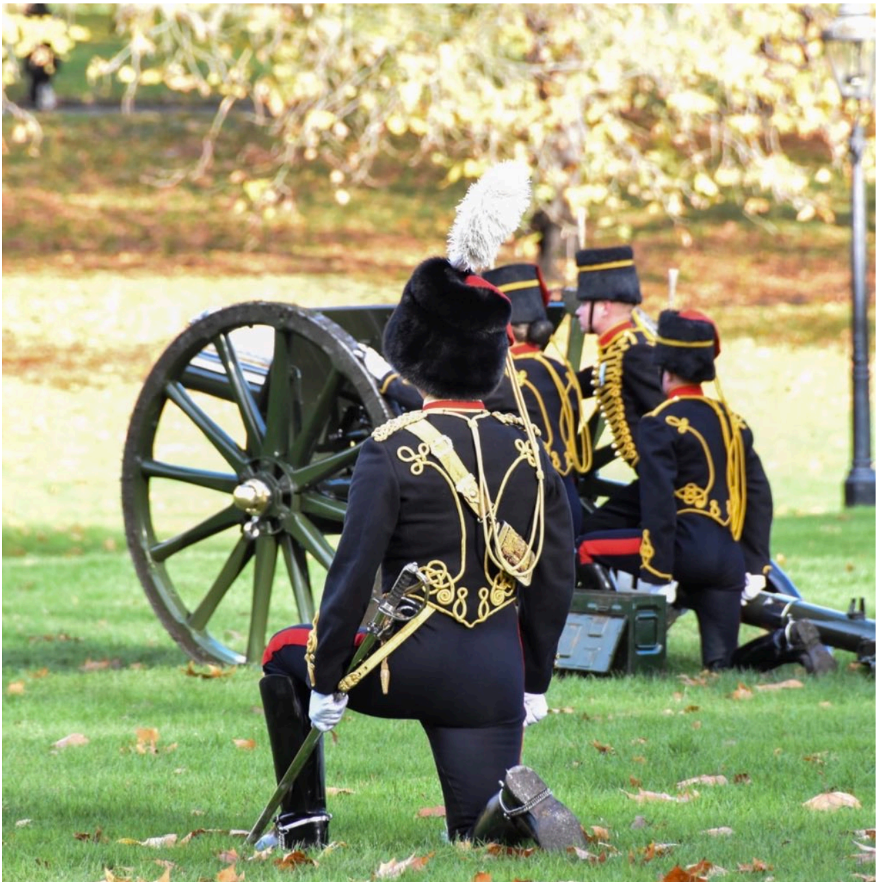
Royal Horse Artillery recognising the Accession to the Throne of HRH Princess Elizabeth on this day in 1952