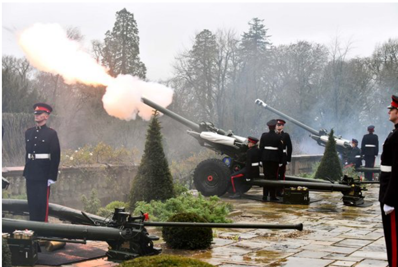
206 (Ulster) Battery, Royal Artillery Volunteers from Coleraine and Newtownards fire the Royal Salutes at Hillsborough Castle.