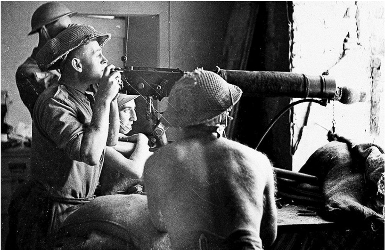
A British Vickers machine gun crew, Italy, 1944