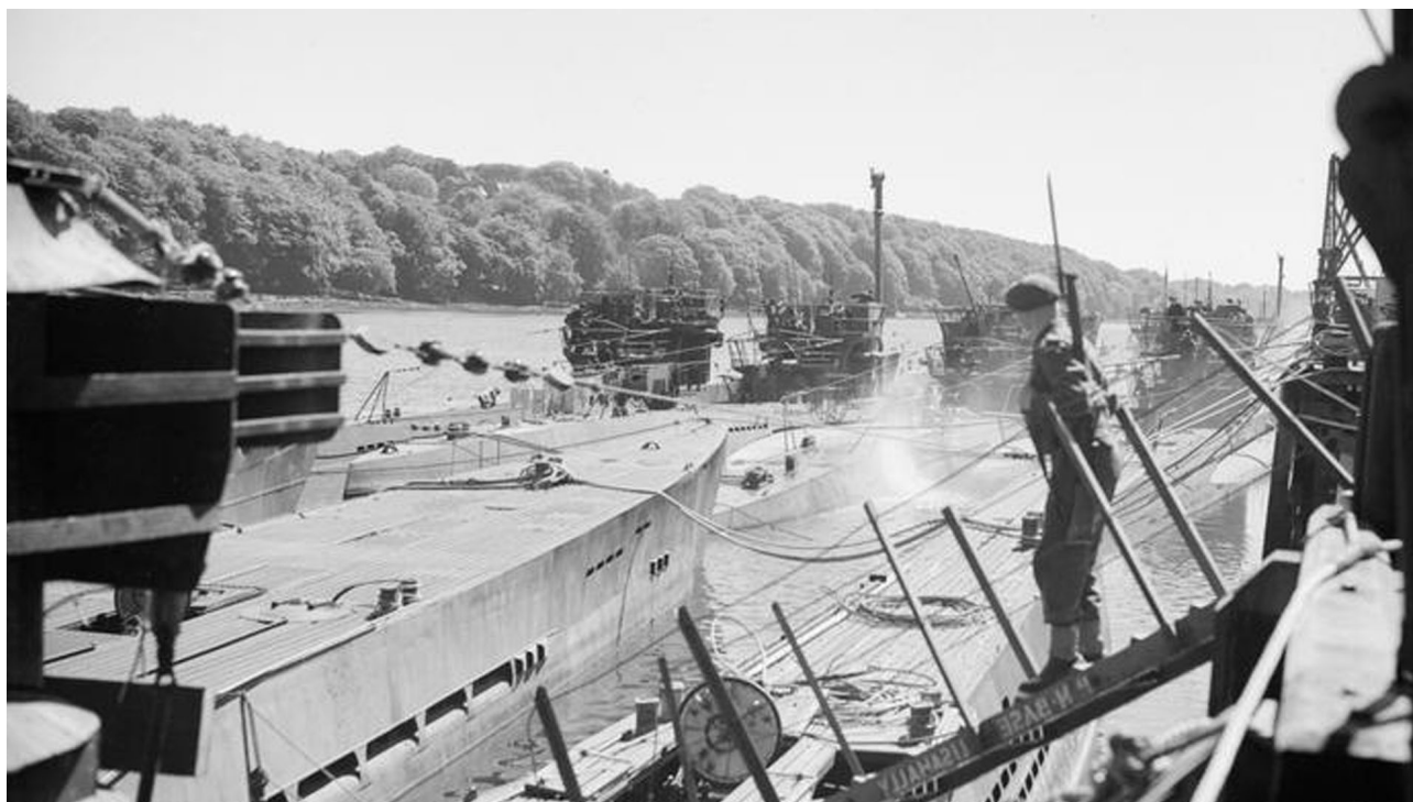
Imperial War Museum Photo: A 28896 (Part of the Admiralty Official Collection). An armed guard watches over some of the surrendered U-boats gathered at Lisahally in Co. Londonderry on 14th May 1945. Copyright Lieutenant CH Parnall.

The Royal Navy White Ensign flew from the U-boats' decks. British seamen watched over the skeleton Kriegsmarine crews as they passed Culmore Point.