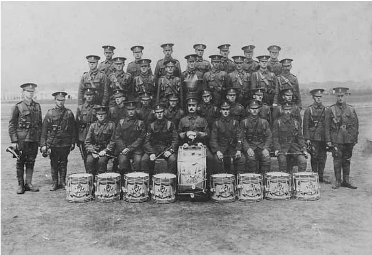
A band of the 36 th Ulster Division