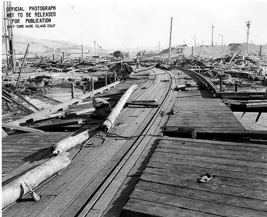
Photo # NH 96821 Damage at Port Chicago, Ca. View looking south from ship pier.

An allied military government (Amgot) is set up in Sicily.