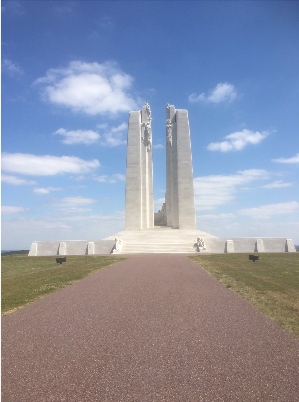
Vimy Ridge Canadian Memorial