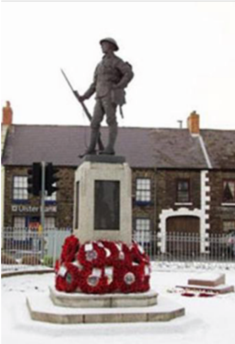
Comber and District War Memorial