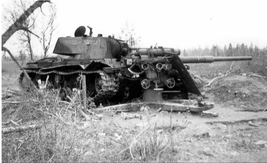
1942 - The Soviet driver of a KV-1 heavy tank rammed his vehicle into a German 88 mm Flak gun