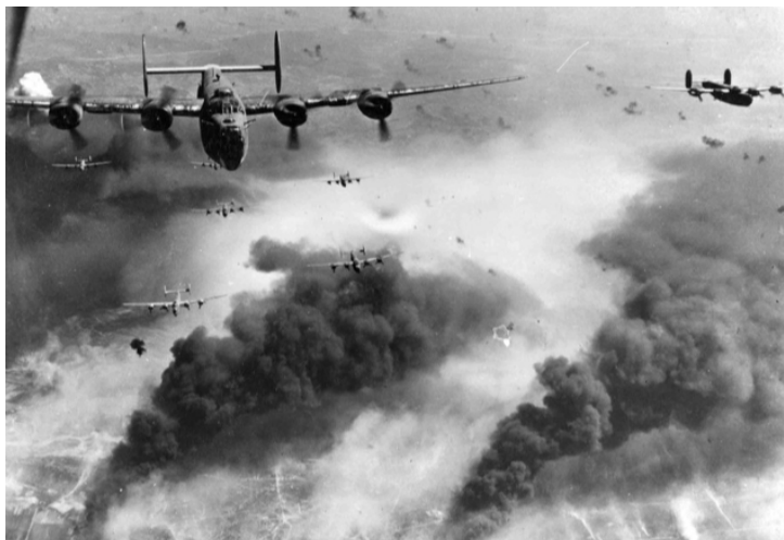
1943 - the USAAF launched Operation Tidal Wave, an air attack on nine oil refineries around Ploiești, Romania. The