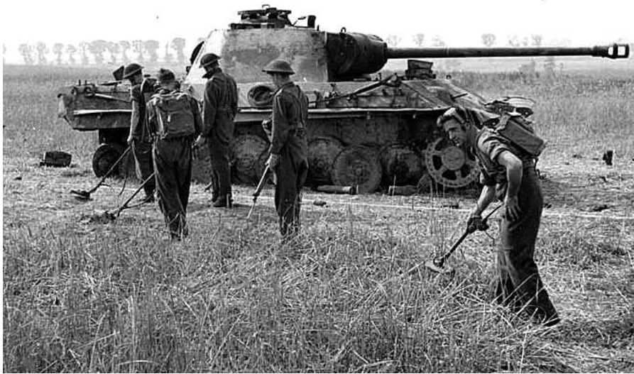
1944 - Villers Bocage area, France. Royal Engineers searching for mines near a knocked out German Panther tank