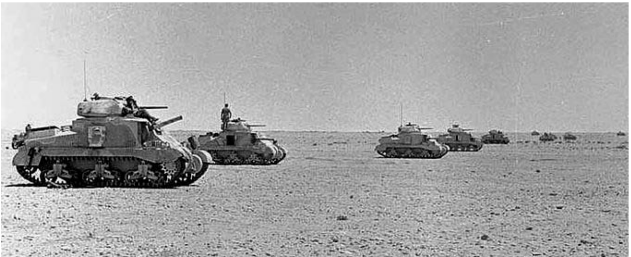
1942 - North Africa. Grant tanks from 22 Armoured Brigade.