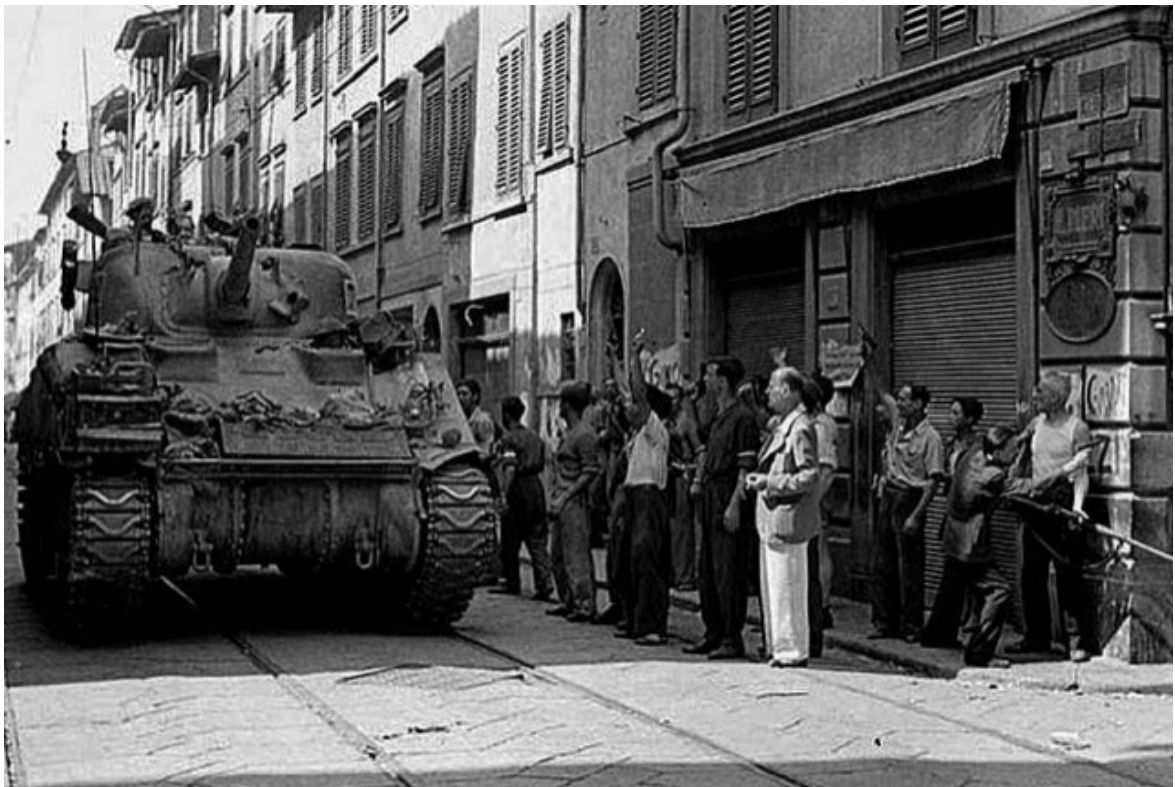
1944 - Florence, Italy. Liberation.