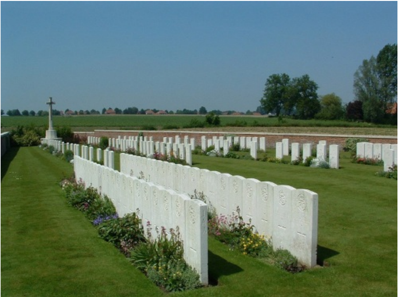
Potijze Chateau Wood Cemetery (above), West Vlaanderen, Belgium.