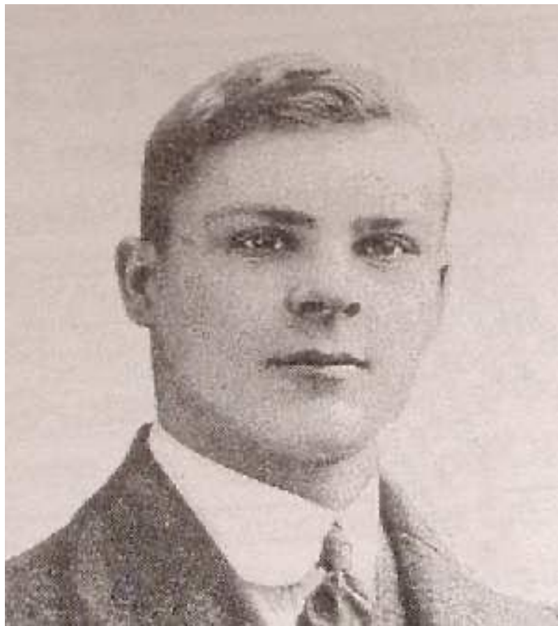
Photo right - had only just arrived with another officer and 89 other ranks as reinforcements when the battalion moved off at noon on 7th September 1914.

One of these actions was by the 2/Royal Inniskilling Fusiliers.