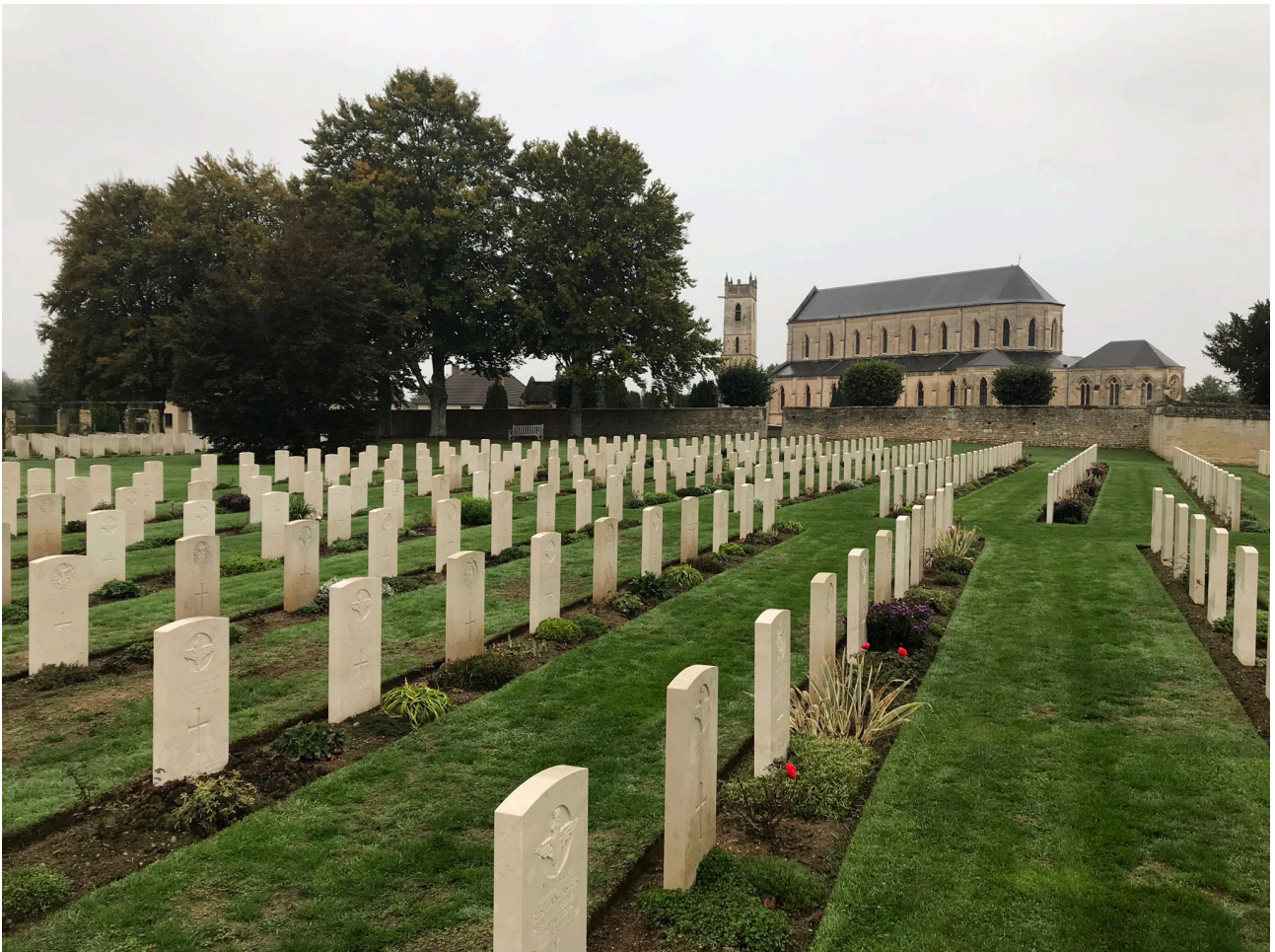
Ranville CWGC Cemetery where there are WW2 graves of RUR